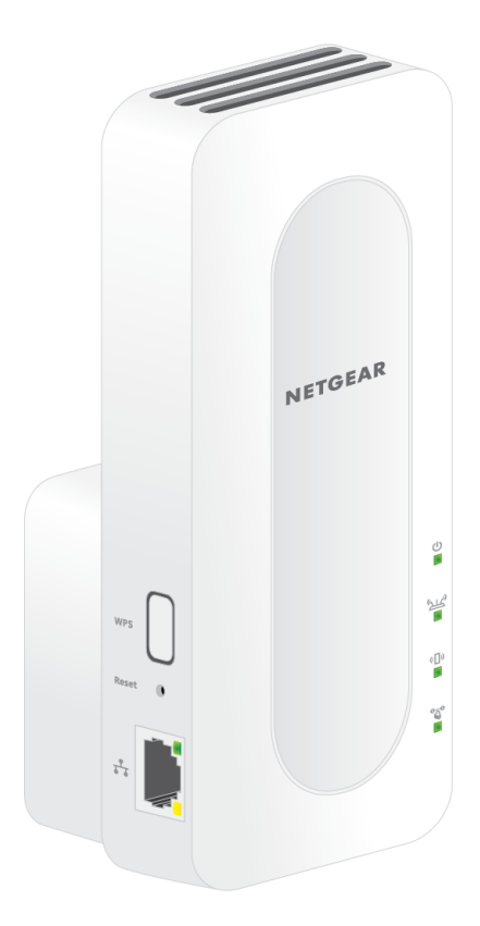
Figure 1. Extender package contents