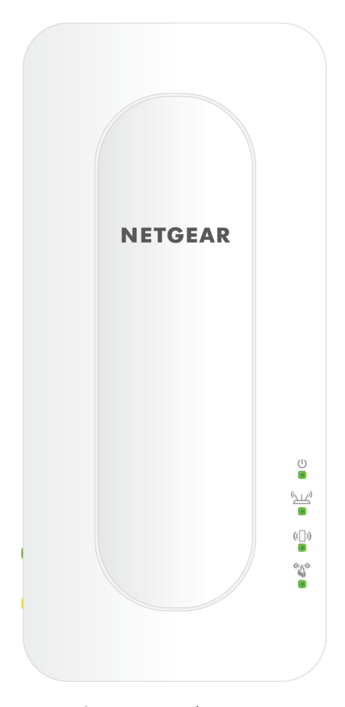
Figure 2. Front panel