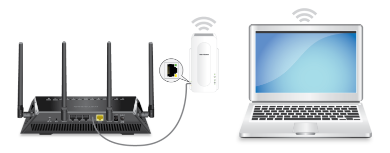
Figure 4. Extender in access point mode

You can use the extender as a WiFi access point, which creates a new WiFi hotspot by using a wired Ethernet connection.